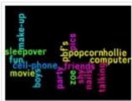
sleepover by Anonymous 0 minutes ago More...