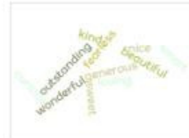
anonomous by Anonymous 1 minute ago