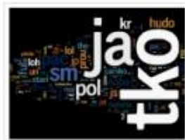
janez by alisic 0 minutes ago