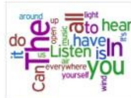
Untitled by August Rush 0 minutes ago